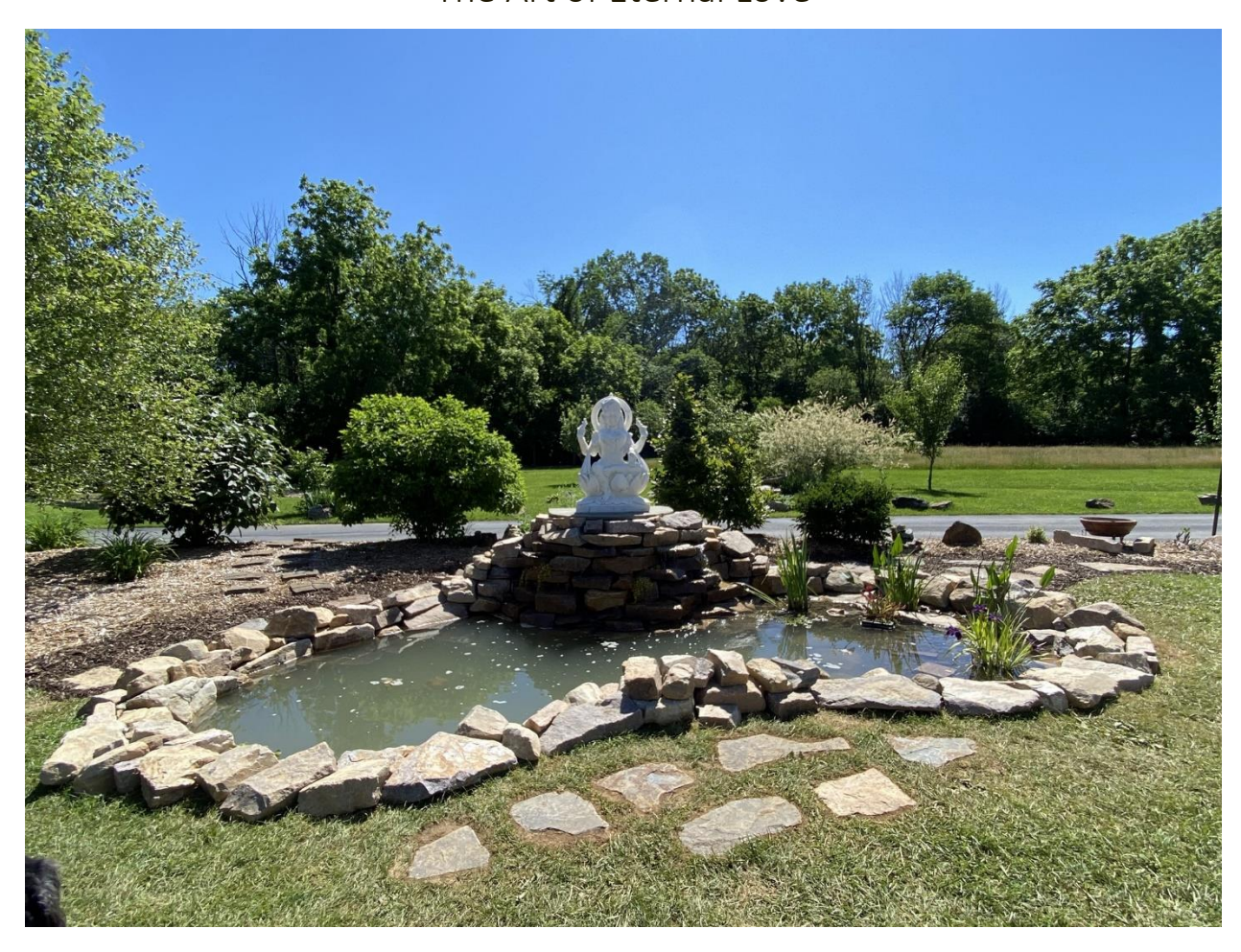
The Art of Eternal Love

My service is to inspire the worship of the divine and to teach people how to worship with the greatest sincerity.