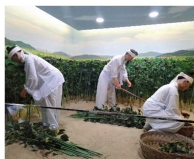
Ramie plantation exhibition, in Seocheon Hansan Mosi Museum (Photo by: Abraão Mendonça, CPI field school 19th August 2019)

In order to ensure vitality of weaving, Korea local government in Seochon-gun establish education center and museum of Hansan weaving, and exactly on 1993 Hansan Mosi museum was opened to public which aim to preserve and promote the tradition and technique of weaving ramie fabric (Kpopmap, 2018). On enhance safeguarding process of Hansan Mosi the central government together with local leaders and relevant stakeholders develop strategy of safeguarding to measure reduce negative impact and threat such protecting community interest, establishment data base including conduct research and increasing government support for the numbers of beneficiaries. In other side to respond the safeguarding plan of Hansan Mosi weaving, the government support practitioners host annual event including public demonstration as well conducted weaving festival had been held for the last 20 years which aim to introduce the fascinating and excellence of Hansan Mosi tradition. In some area, the traditional knowledge of weaving continues existing such in Andong, Hansan, Geumseong and Naju, even government supported some practitioners and artisans to practice and transmit as ICH (Kwang-seop, 2009).