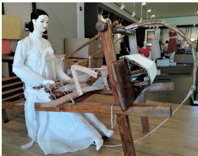
Threads from ramie and traditional loom exhibition in Seocheon, Hansan Mosi Museum