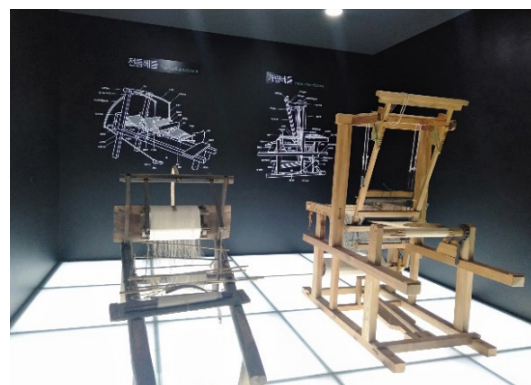
(Left) : Korea women weavers and (right): Traditional loom exhibition in Seocheon, Hansan Mosi Museum