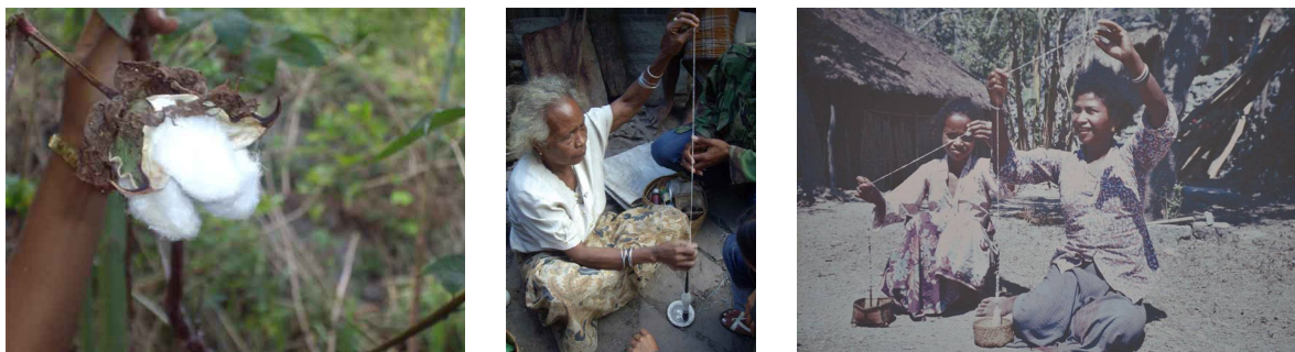
(Left): Cotton tree to make a traditional thread. (Middle and right): The process of spin cotton (Sources: Brigitte Clamagirand France Anthropology and Stories from the youth of Suai, Traditional Art & Identity).

Usually a simple back strap loom is used to make Tais. Usually it is made pieces of wood then are formed in a way that is adjustable to provide comfort to the weavers. The pressure from the strap and the time required for the intricate designs on many Tais produce significant pain for many women 13) . In general, a loom between three generations of women, are now unattainable and unable to use by many young Timorese 14) . Basket for holding cotton while spinning which this basket is seen many places in the villages (Jean Howe, 2009).