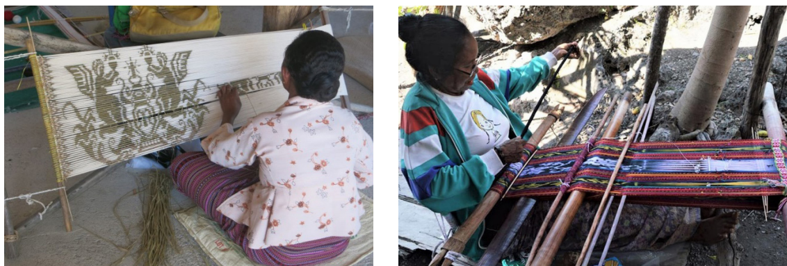
Left: Binding use futus technique

Tying a set of threads is the most indicate and time-consuming aspect of weaving Tais. The thread is first wound into a bamboo frame. Section forming the motif are tied off with palm leaf strips and the cloth is then submerged in dye. The ties block the dye tied threads retain their original color. After the ties are carefully cut away, the threads are woven into the Tais to reveal the motif 20 . As challenges, due painfully job including time constraining to produce Tais and lack of raw material, most of the Timorese weavers have decided to make a Tais from imported modern threads which mainly from neighbor country Indonesia with cheaper cost.