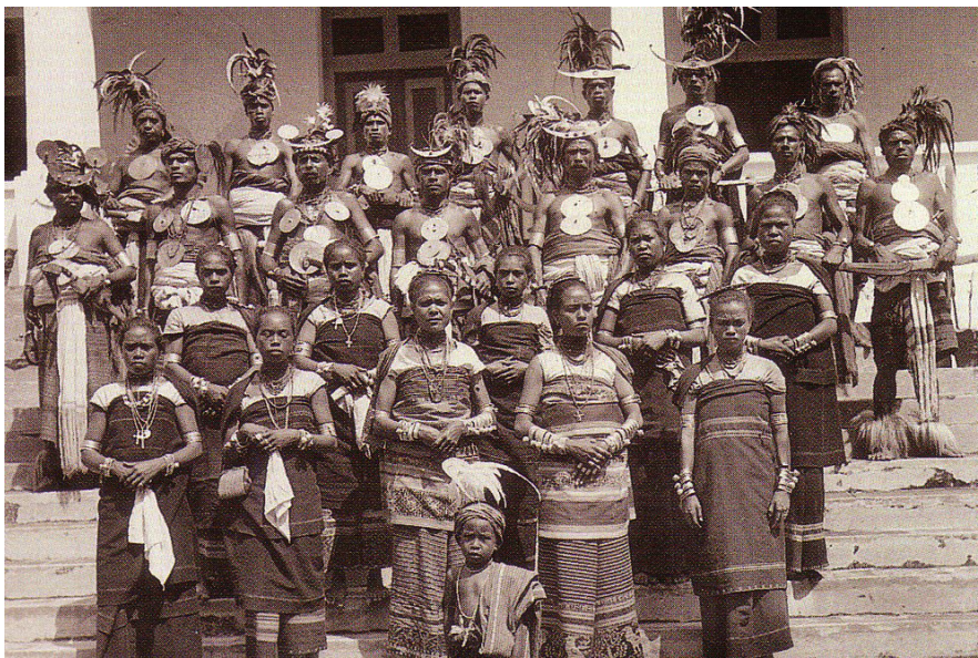
King Dom Aleixo Corte Real and families together with head of villages wearing Tais (Portuguese Timor 1938).

The weaving, wearing and use of the textiles are essential to the Timorese sense of being and was a way of asserting their difference during Indonesian occupation (Cristalis, 2005). More generally, women in villages appear enthusiastic to utilize these skills and to pass the knowledge on to future generations (Niner, 2007). Significantly, traditional textile cloths are traditionally given by one Timorese woman to another as a mark of respect or symbol of repentance 9) and more importantly, during Portuguese colonialism since 1515 - 1975 Tais handcraft become as formal clothes 10) for the royal family as symbol of culture identity (Murray, 2009).