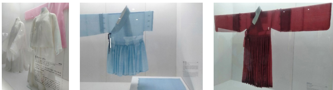
Ramie clothes exhibition in Seocheon Hansan Mosi Museum

While on 1930 on the establishment of fame, Hansanmosi was considered the king of Joseon fabric. Specialty of the specialties, and the best quality and color fabric in Joseon and Hansan was widely known as the best quality produce of ramie fabric. On 1960 supply of Ramie was improved and contribute household transmission of ramie weaving techniques and family income. However, ramie fabric demand was decline on 1950 after the liberation and continuing on 1970, this was sharp decrease in ramie fabric producers. Later in 1980, Government led promotion of ICH transmission, through improvement of ramie weaving environment, and introduction of improves loom. The establishment of Hansanmosi association in 1990, was re-establishment of Hansanmosi reputation as a byword for ramie fabric.