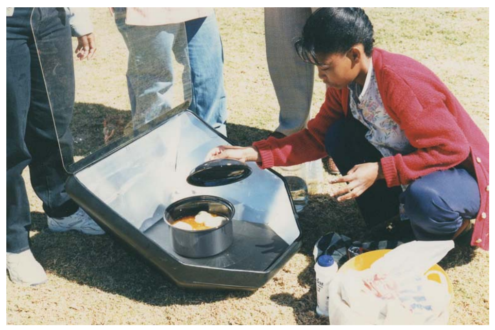
Figure 3 SCFT practical cooking test in Silverton

The most important information on the local conditions can be compiled in form of "cooking profiles" (see in Figure 4 the example of a cooking profile established during the SCFT). It should be noted that cooking profiles can be established not only for solar cookers, but for all types of cookers and fuels.