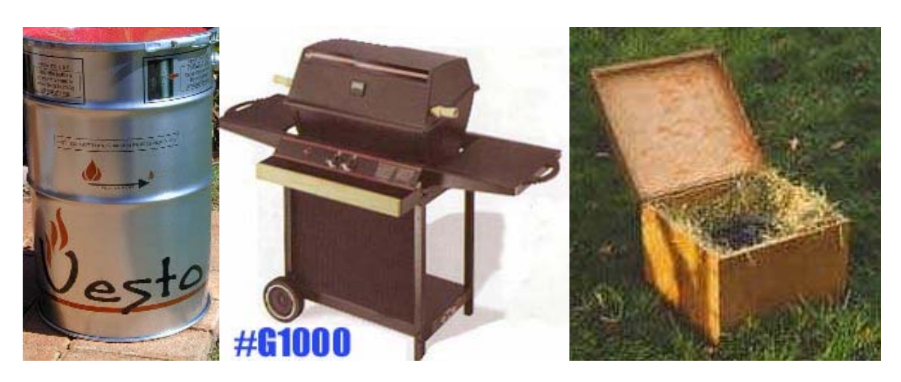
Figure 5 The competition: improved wood stove, hydrogen cooker and hatbox

The relative simplicity of the base data (number of MP – meal portion, and stove type, compared to direct fuel consumption measurements) allows for auto-monitoring by the user - with guidance, help and control by monitors. From a project point of view, this means less invasiveness, a lesser burden on the users time and patience, and lower cost. A monthly monitoring log (Tool 5) is shown below.