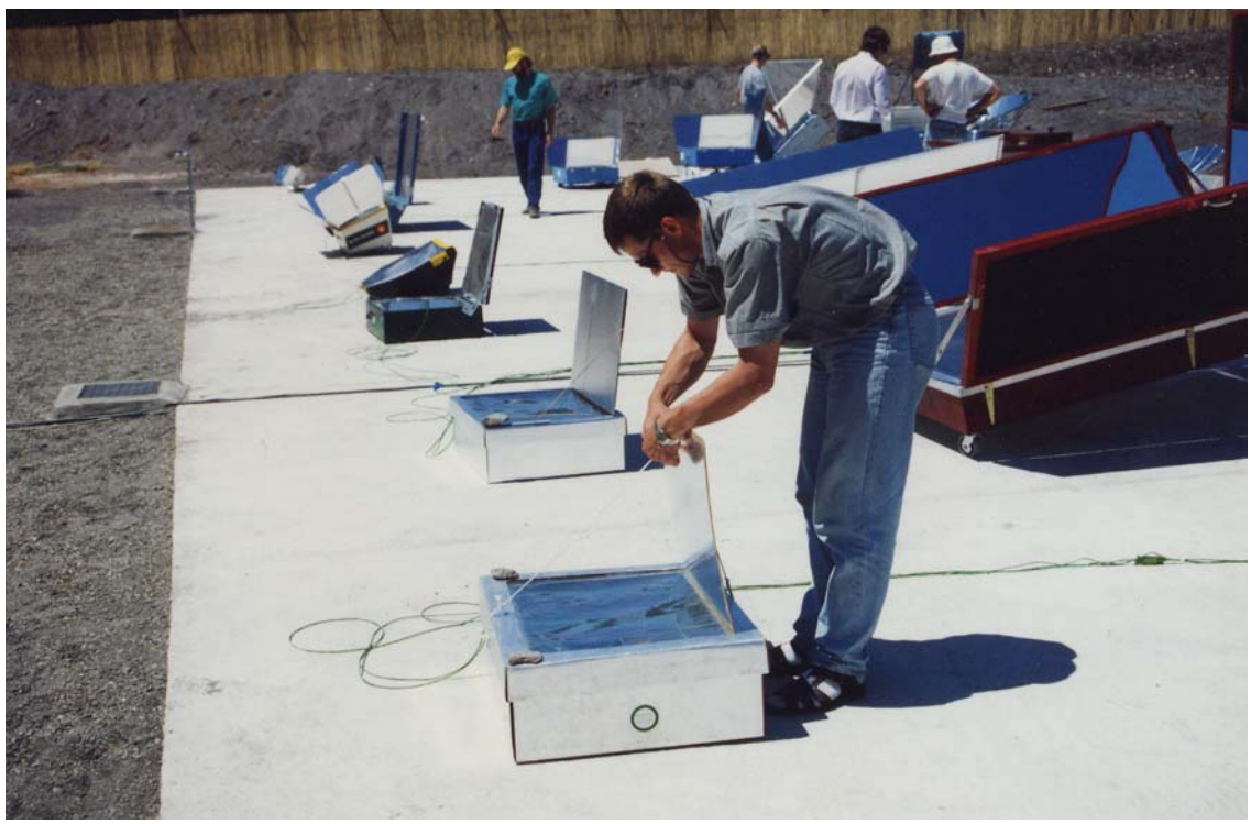
Figure 1 A row of boxes during the ECSCR test in Almeria

For the first official test of 25 cookers conducted at the Plataforma Solar de Almeria (Spain), this meant test equipment in the order of 30,000 US$, plus a 500 m² platform with power and water supply, next to a shaded office to protect data acquisition and operators, two trucks to bring in cookers and hardware, 6 testers and the appropriate clear sky without strong wind - all this within the allocated one-week stretch.