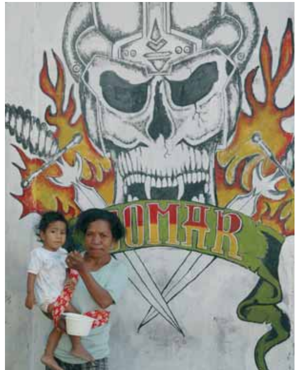
Mother and child standing in front of gang insignia, Dili, 2008

Identifying and monitoring the presence of gang members in state employ is also an important measure to disrupt these linkages. Security forces should be required to declare MAG and gang membership in order to better control the influence of these groups on individual members of the state forces; a MAG membership register would be a useful tool to keep track of these elements. Compelling politicians and civil servants to similarly declare their affiliations would be equally beneficial. Transparency can in itself be a powerful tool.