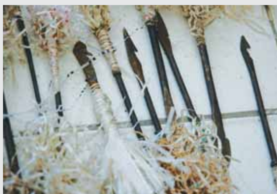
Rama ambons collected in police raid, Dili, 2008

While gang members sometimes speak of unofficial rules of engagement that forbid the use of manufactured guns, there is no doubt that, with links to the security forces, all the major gangs have access to such weapons. One factor discouraging gun use may be that communal disputes sometimes pit former friends and neighbours against one another, and resistance is strong to seriously injuring a former friend.