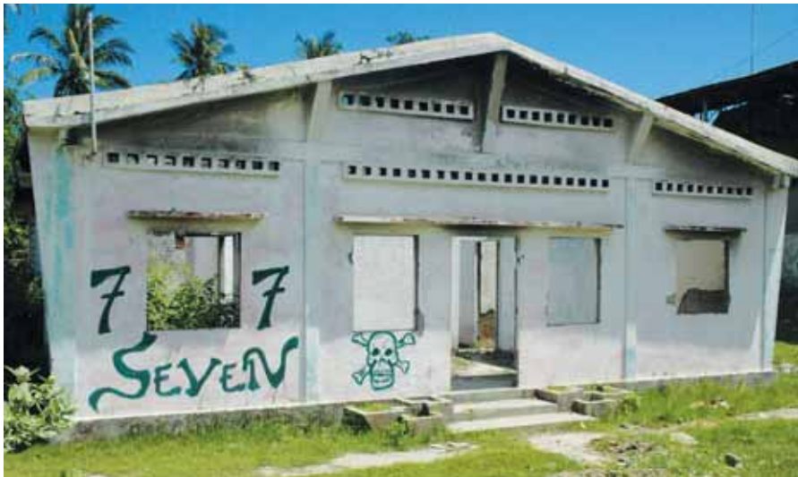
Gang graffiti on an abandoned house, Dili, 2008