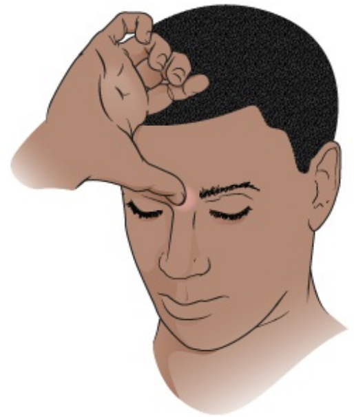
Figure 2. Placing thumb between eyebrows